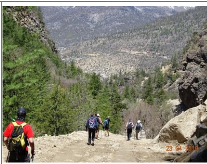
steep and narrow or wide and easy to walk, but