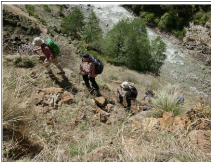
The road to the school home is varied. It can be

Most schools have been closed since the 24 th of march. Some schools in rural areas have slowly started again. A few schools have tried to keep up online classes. But most of the pupils do not have access to online Classes.