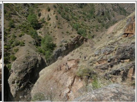
being a road worker here can't be easy