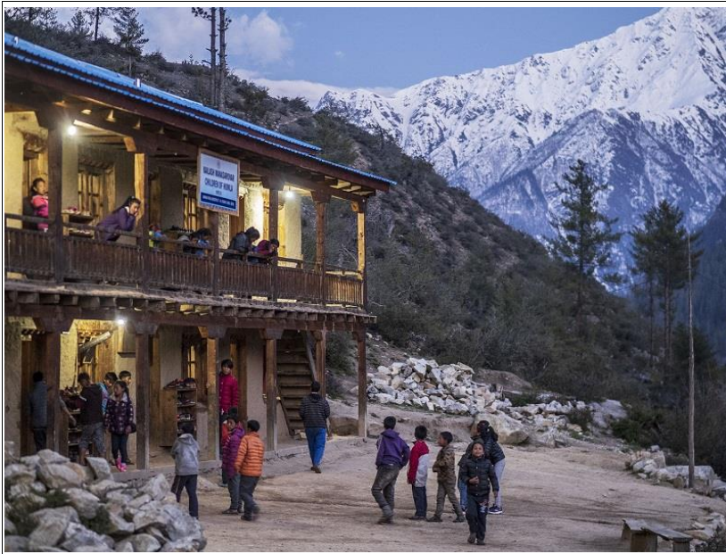
The school home in the evening.