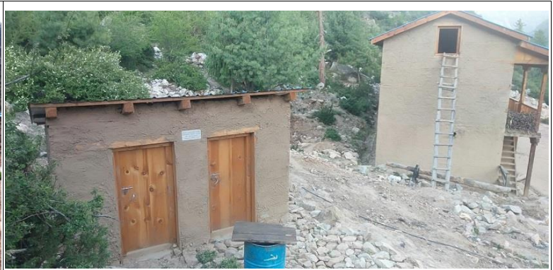
The new toilets at the gable of one of the sleeping houses.