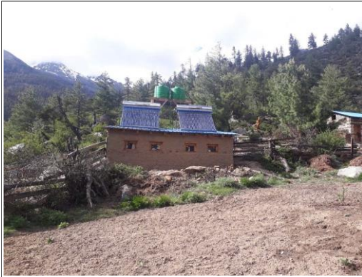
The house with four walk-in showers