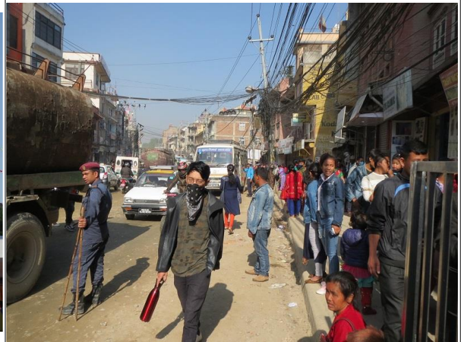
Street view from Kathmandu. Note the tangled wires

During the months of lockdown, the government had plenty of chances to prepare for the expected increase of Corona patients. It has been sad to see how the government instead focus on internal struggles. The prime minister Oli has been under a lot of pressure from different groups within the Nepal Communist Party. The leading politicians spend their time fighting for power. Oli's main opponent, Dahal, the leader of the former Maoist party, has demanded Oli's resignation so he can strengthen his own powerbase.