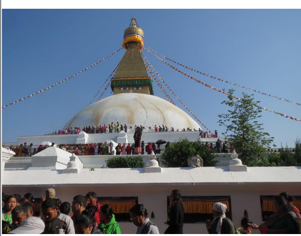
Boudha Stupa in Boudhanath Kathmandu