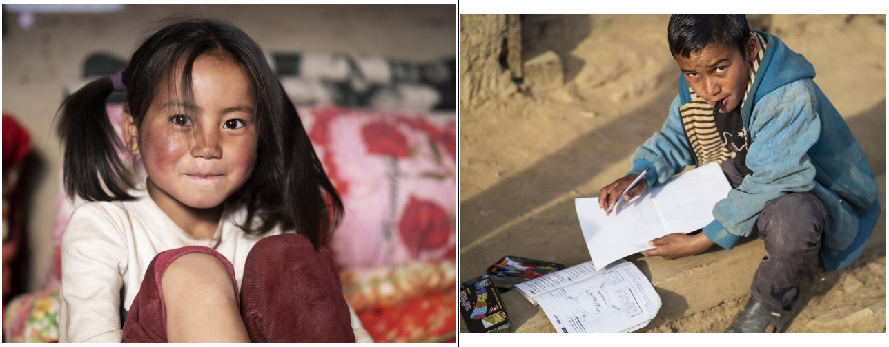
Two children in April 2019.

Do you no longer want our mailings? Cancel Here >>