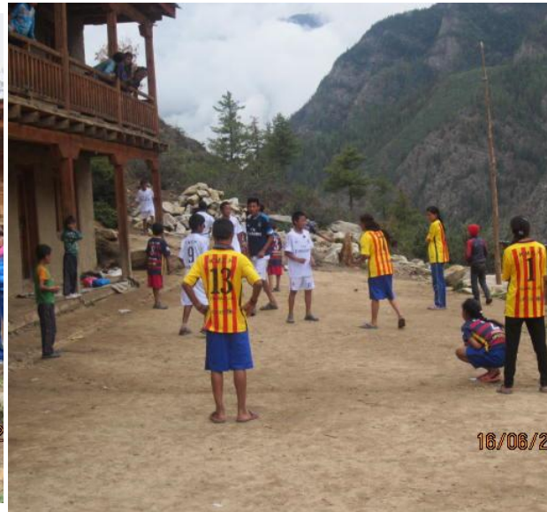
Football game in new sport clothes