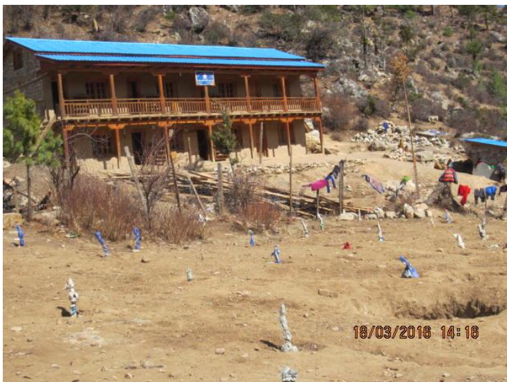
Some new Apple seedlings in front of one of our houses