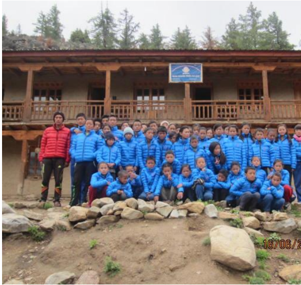
New jackets for the cold season. A gift from ADATA..