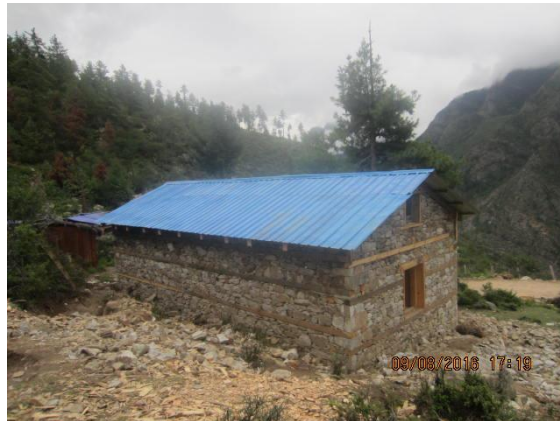
The old kitchen in a cold wooden shed The new kitchen in a solid stone building.