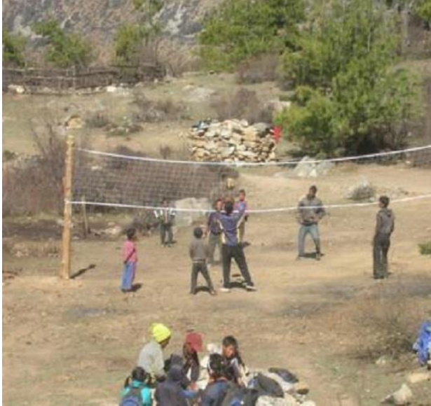
Annual meeting in KMCH Nepal