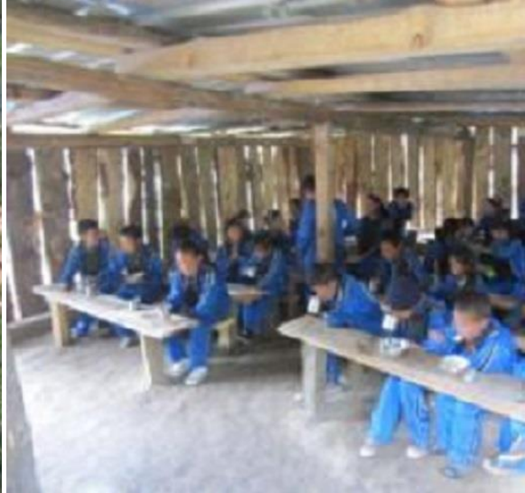
The dining hall under construction