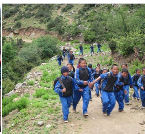
Children on their way to school