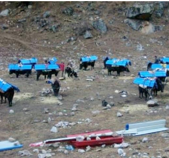
The metal plates for the roof are loaded at the boarder of Tibet

We are pleased that the main building now is completed. It facilitates the everyday life for both the children and the staff. The house has electricity coming from a micro hydro power station in a river outside the village. The building has been completed on "borrowed" money.