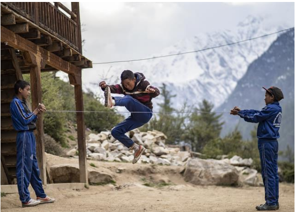
children playing at the school home.