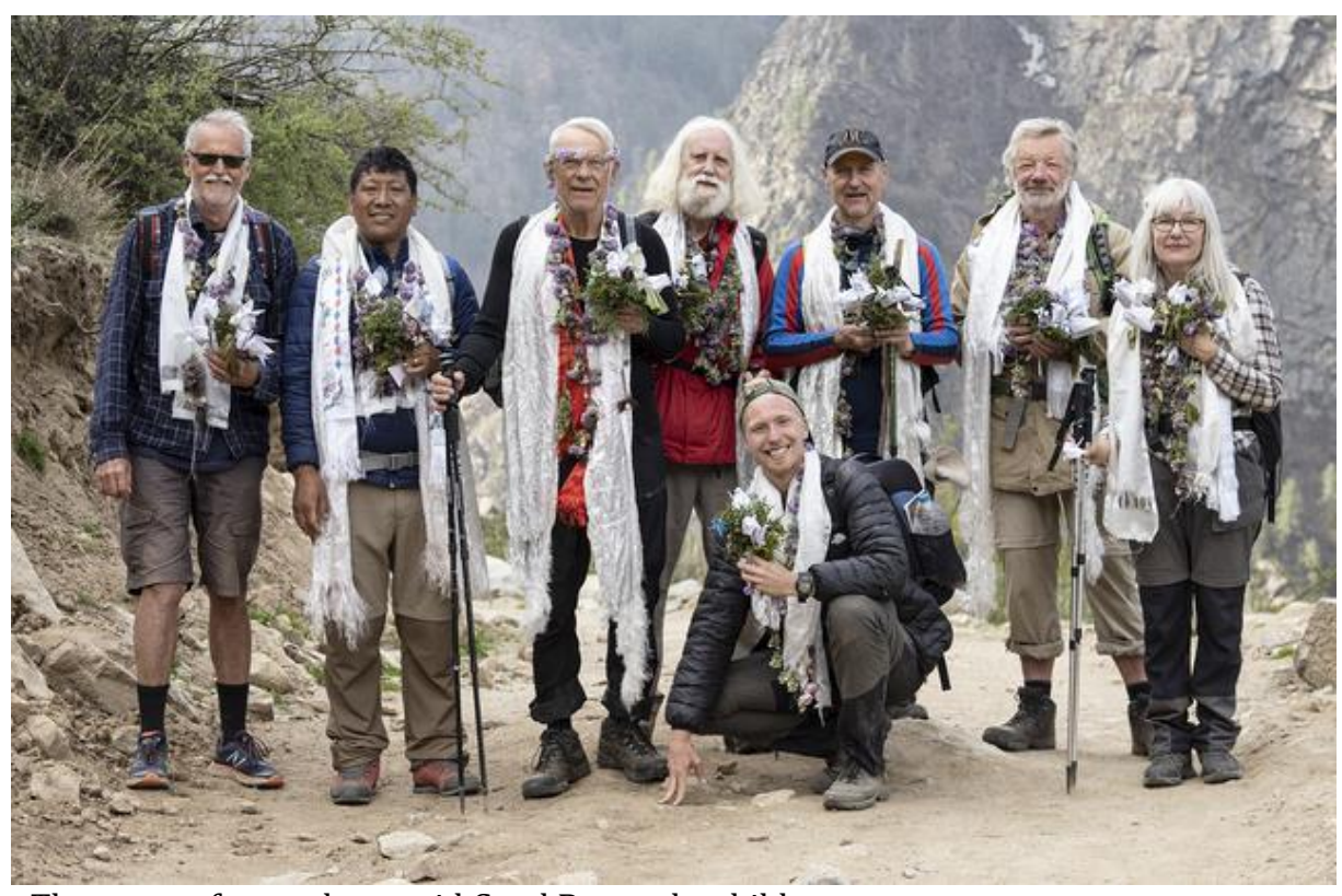
The group after we have said Good Bye to the children.

Do you no longer want our mailings? <u>Cancel Here >></u> Org.nr. 802437-1810 Bankgiro: 5604-4019 Swishnr.: 123 412 51 91KMCH Support Group <u>www.kmchumla.se</u> E-mail: <u>info@kmchumla.se</u>