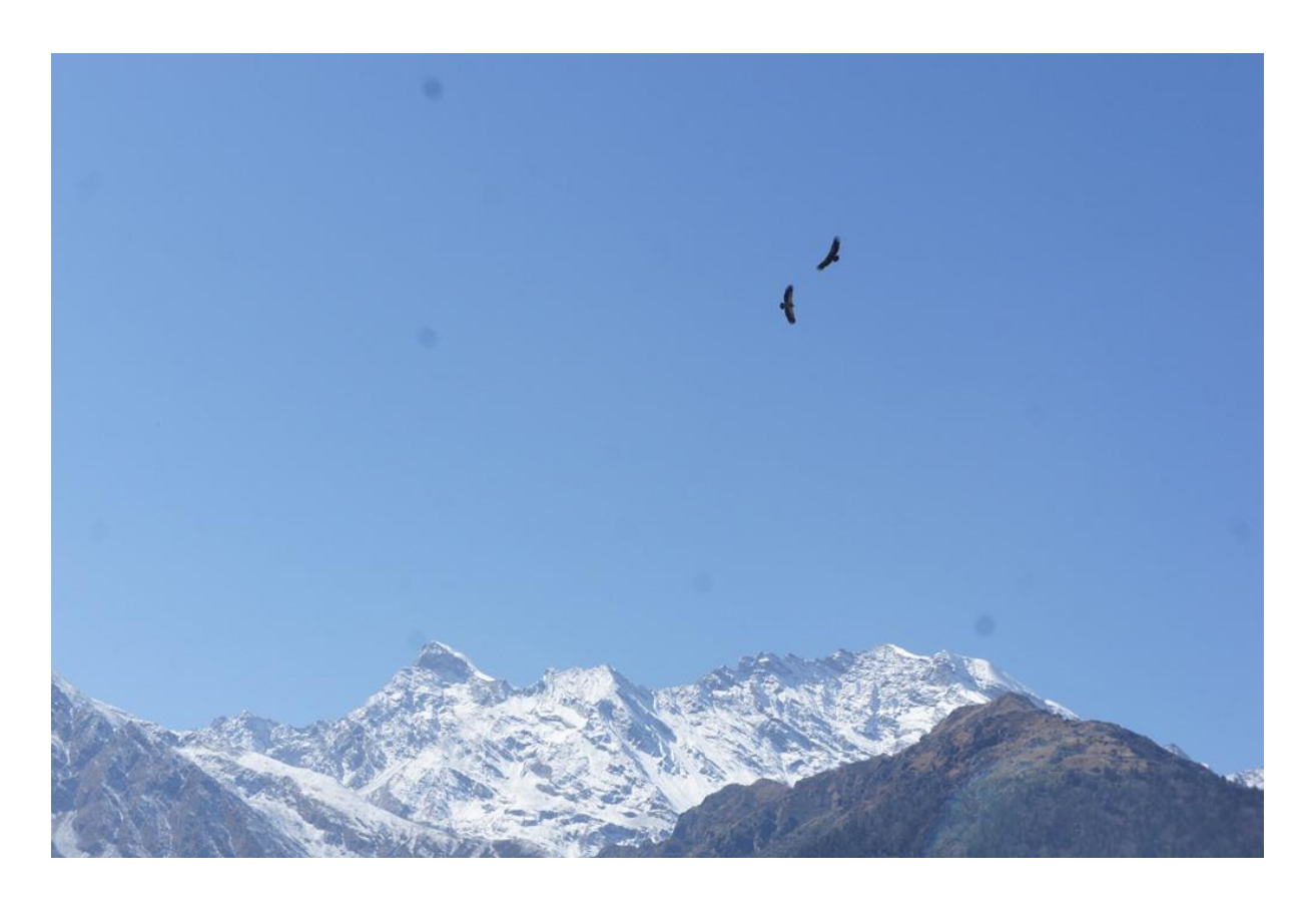
(This image, taken by Richard, has been showed before but worth show multiple times. A powerful and beautiful landscape meets the wanderer in Humla. Well worth a visit.)

Vill du inte längre ha våra utskick? Unsubscribe here. Avbeställ här >> {/unsubscribe}