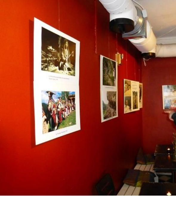
Cafe Mariaberget is located at Blecktornsgränd 4 on Södermalm in Stockholm. Opening hours: Saturday and Sunday. 11: 00-17: 00, Tuesday to Friday. 11: 00-18: 00 (Closed on Mondays.) See <a href="https://www.cafemariaberget.se">www.cafemariaberget.se</a>