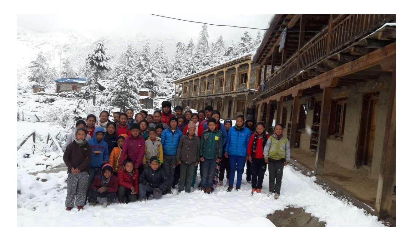
... from the kids at the school home.

Org.nr. 802437-1810 Bankgiro: 5604-4019 Swishnr.: 123 412 51 91