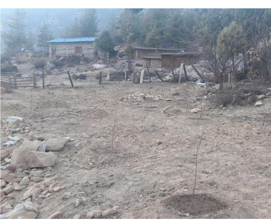
A large hole is founded with mulch