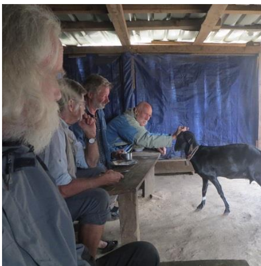
In the old dining hall you had to protect your food.

I guess that everyone at the School home is happy with the water and sanitary project which, in principle, was completed in year 2015. Now there are several water taps and two more toilets. We also have stoves in the children's room so that they at least occasionally may have a sleeping temperature higher than the temperature outdoors. At the altitude of three thousand meter it can be cold at night, even in spring. With our standards, their living conditions are still very primitive, but we are trying gradually to make them more bearable.