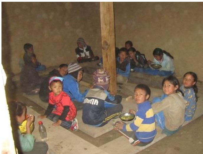
In the new you can both eat and study in peace although real benches are still missing.