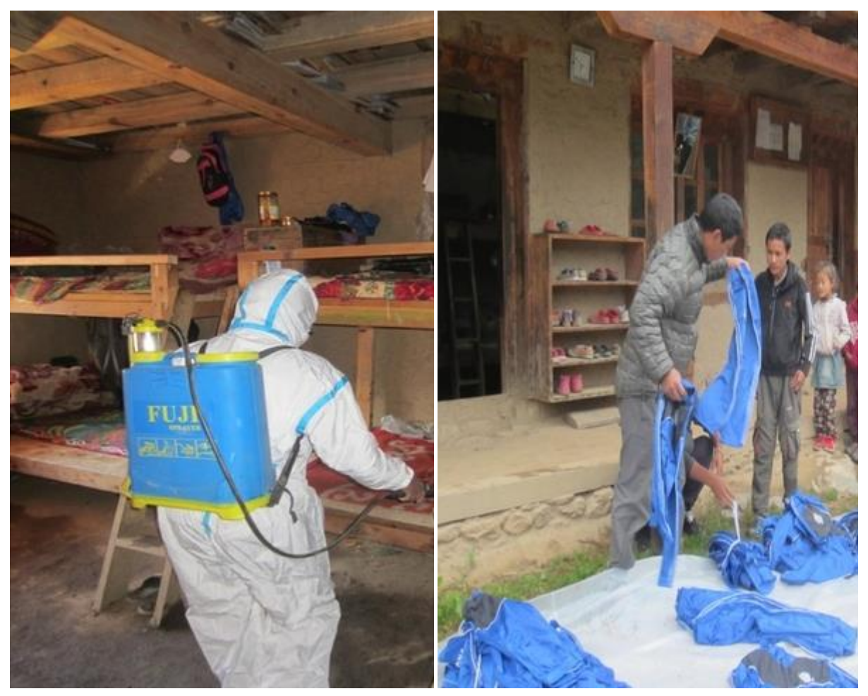
Not only face masks and hand sanitizer were used as coronaprevention.

During the year, the children have been able to wash themselves in solar-heated hot water, which is much appreciated. A lot has happened since we camped in the area in 2011, which was then almost virgin land. However, it can be even better.