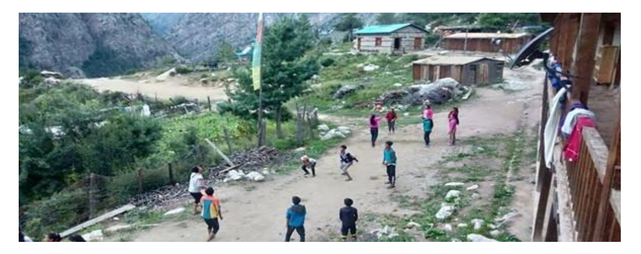
Play outside the school home far from the politicians' squabbles

An equally big topic is the Nepal Communist Party and how they have acted in parliament since September. In protest against the speaker of the parlament the party has completely obstructed the parliamentary work. I have watched recordings from the Parliament and it is sad to see NCP Members leaving their seats, chanting slogans and making the duties of Parliament impossible. And this happens every time Parliament gathers for debates and discussions.