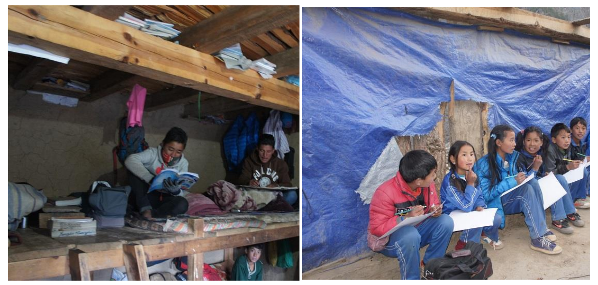
The children at KMCH are doing their homework in the sleeping rooms,

It is an easy 20 minutes' walk to school. At the school, we are, as in two previous visits, welcome to visit the classes. Some groups are large, more than 30 students, but we also meet smaller groups. The groups are often mixed age. In some of the rooms the children sat on the floor in a ring with a teacher. Groups of older students were often smaller and they sat at desks that they shared with 2-3 students. We visited an English lesson. Just then they worked with increasing their vocabulary. The teacher used a small computer screen. He showed different pictures, pointed at the screen and said in English what the object was called. The children then repeated in chorus. This method seemed to be the way; the children repeated what the teacher said. In another classroom a class 9-10 worked with mathematics. The theme of this particular lesson was quite complicated geometric calculations. It could have been a lesson in my own school, but without the technique of smartboards and computers. The atmosphere in the different classrooms seemed to be very good despite the sometimes large classes. There seemed to be a friendly and helpful tone between teaches and students and among the students. A sign outside one classroom showed us the way into to the school's computer room. Shree Marhaboudha School has bought 10-15 computers, which give the children chances to work with computers. So far though, there is no internet connection.