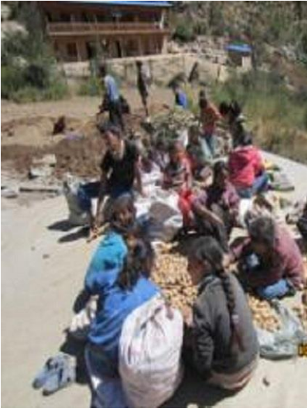
The children sort this year's crop of potatoes